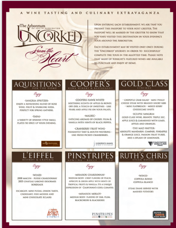
Uncorked passport event guide.