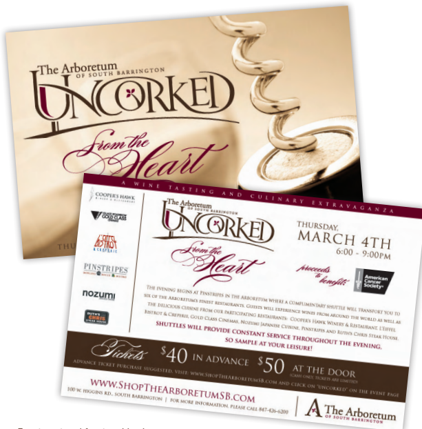
Event postcard front and back