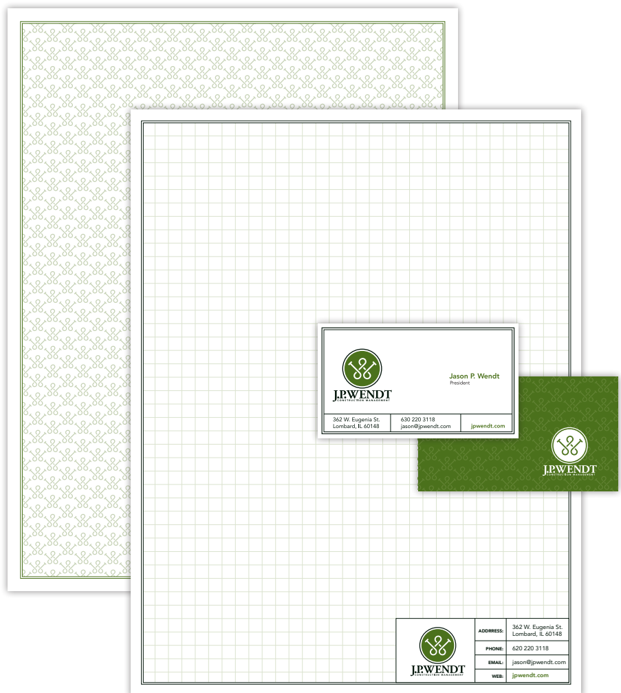
2 sided letterhead, 2 sided business card

Logo created using construction elements and the initials of the company name.